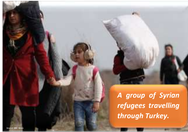
A group of Syrian refugees travelling through Turkey.

A refugee is someone who has been forced to leave their home country as they believe their life is in danger.