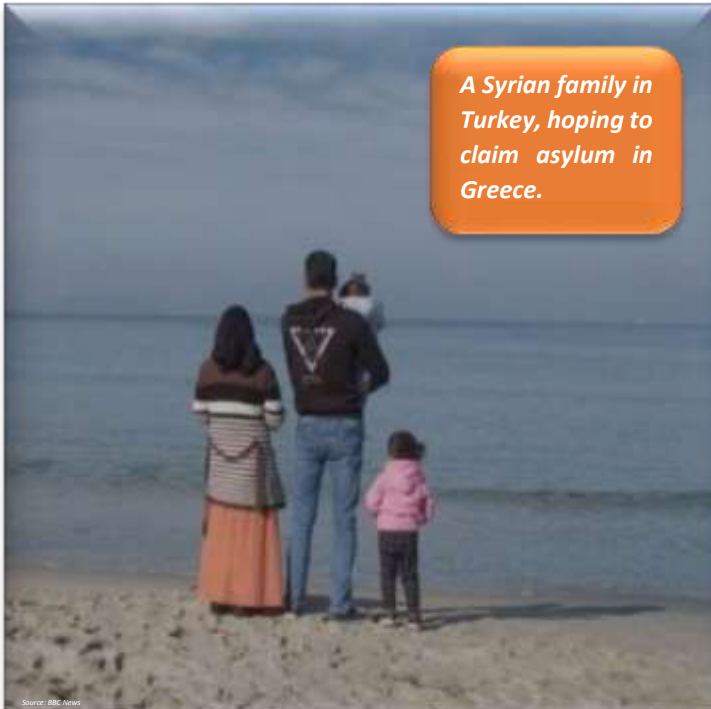
A Syrian family in Turkey, hoping to claim asylum in Greece.

“Refugees are among the most vulnerable people in the world. The 1951 Refugee Convention and its 1967 Protocol help protect them.”